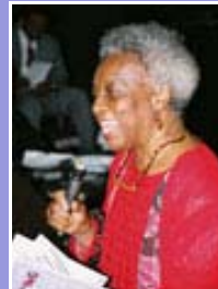
AABBA Networking Event